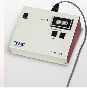
Left: Motor drive assembled to the depth drive