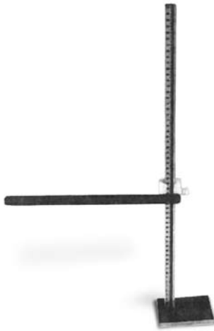
Table Top Caliper

The table top caliper with a 55 cm scale can only be used to measure from the table top to the top surface of the patient.