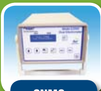
CNMC • Instruments for Medical Physics