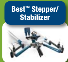
Best™ Stepper/ Stabilizer