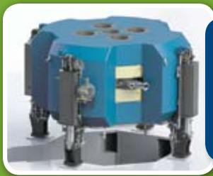
Best™ Cyclotron Systems 15, 20u/25, 30u/35 & 70 MeV