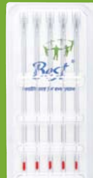
Best™ Flexi Needles