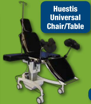
Huestis Universal Chair/Table