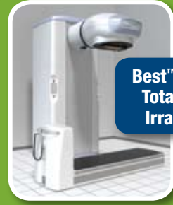
Best™ GB500 Total Body Irradiator