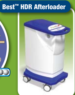
Best™ HDR Afterloader