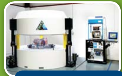
Best™ Dose On Demand™ BG-75 Biomarker Generator 7.5 MeV Cyclotron