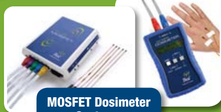
MOSFET Dosimeter Systems