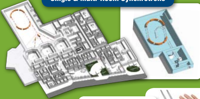
Best™ Particle Therapy Proton-to-Carbon Upgradeable Single & Multi-Room Synchrotrons