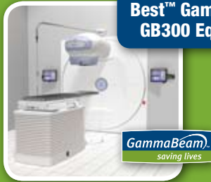
Best™ GammaBeam™ Systems GB300 Equinox & GB100-80