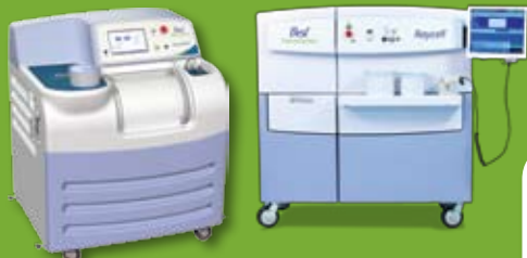
Best™ Raycell Mk1 & Mk2 Blood & Research Irradiators