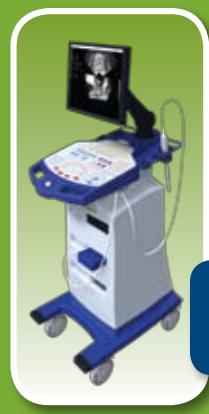
Best™ Sonalis™ Ultrasound Imaging System