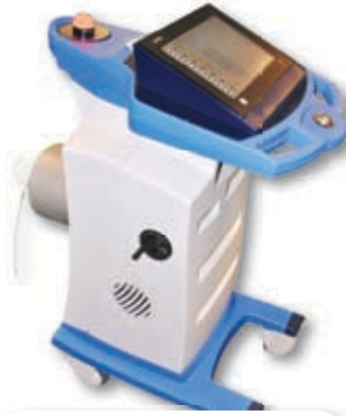
Best™ HDR Afterloader