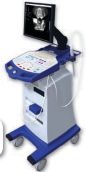
Best™ Sonalis™ Ultrasound Imaging System