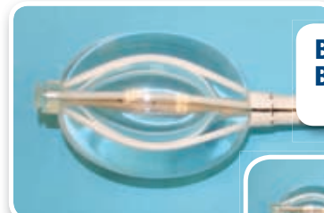
Best™ Double-Balloon Breast Brachytherapy Applicator