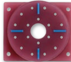
Best™ HDR Prostate Template (Disposable)