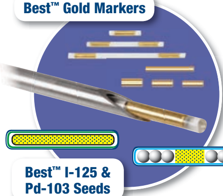
Best™ I-125 & Pd-103 Seeds