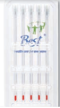
Best™ Flexi Needles