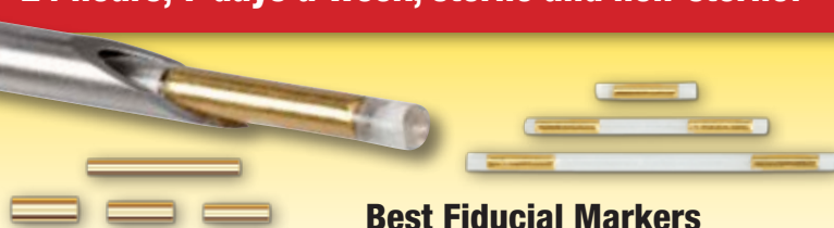
Best Fiducial Markers

Best™ Seeds have the best visualization in ultrasound, fluoro, x-ray, CT and MRI, facilitating real-time dosimetry