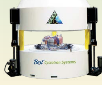
Best B 100p, BG 95p and B 11p Sub-Compact Self-Shielded Cyclotron w/Optional Second Chemistry Module