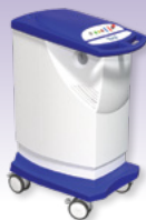
Best™ HDR Remote Afterloader