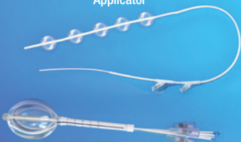
Best™ Breast Double-Balloon Brachytherapy Applicator