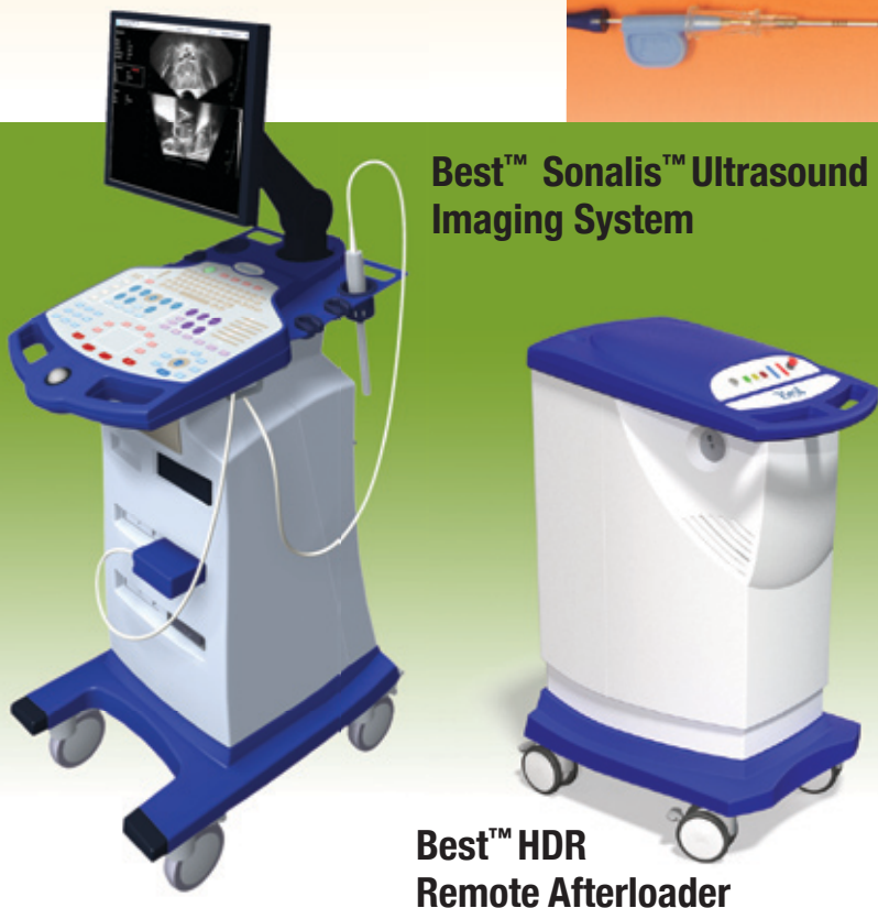
Best™ Sonalis™ Ultrasound Imaging System