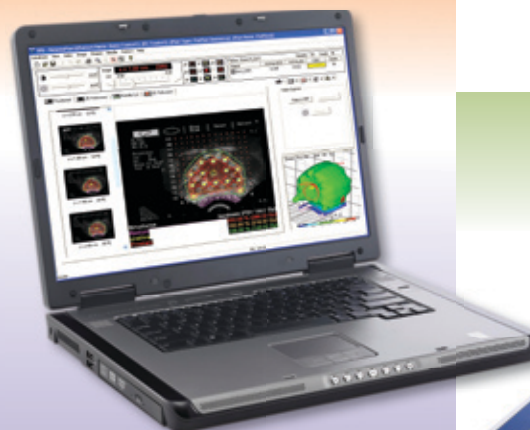
Best™ Treatment Planning System