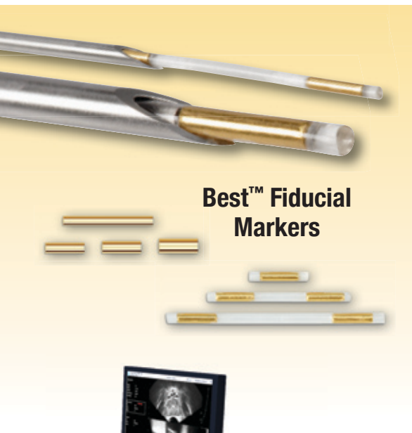
Best™ Fiducial Markers