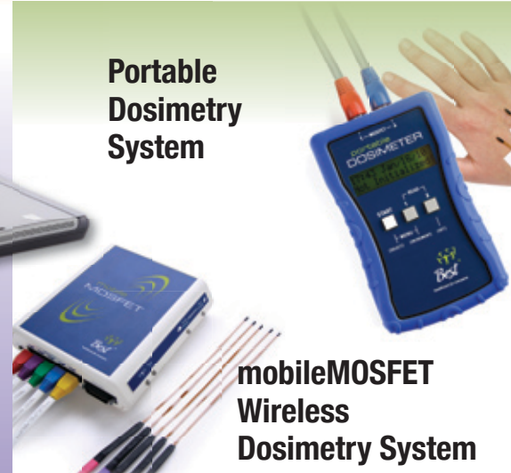
mobileMOSFET Wireless Dosimetry System