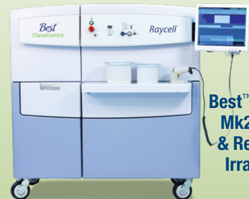
Best TM Raycell Mk2 Blood & Research Irradiator