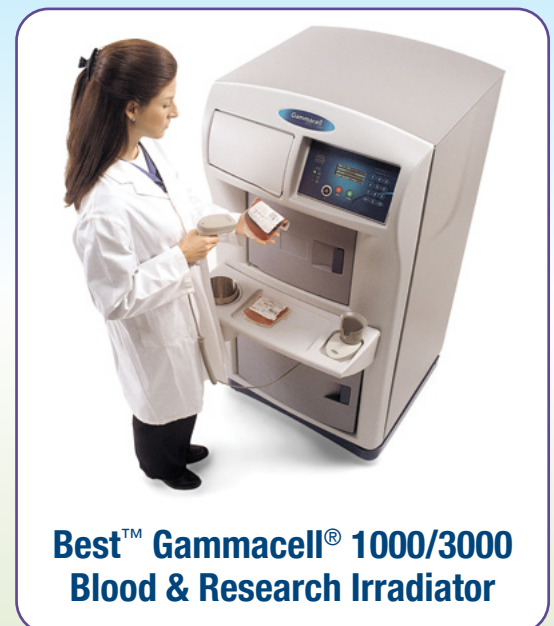
Best TM Gammacell ® 1000/3000 Blood & Research Irradiator