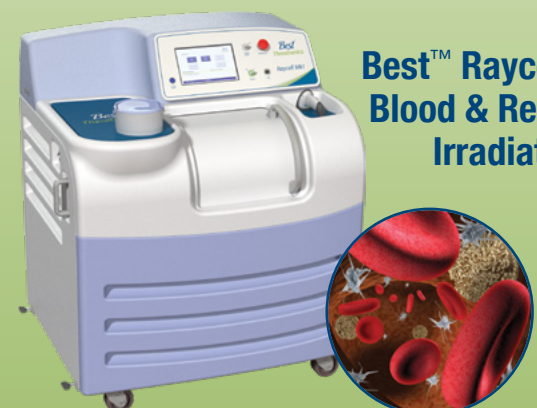
Best TM Raycell Mk1 Blood & Research Irradiator

Best Theratronics Ltd., 413 March Road, Ottawa, Ontario K2K 0E4 Canada tel: 613 591 2100 866 792 8598 www.theratronics.com www.teambest.com