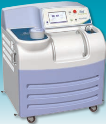
Best™ Raycell Mk1 Blood/Research Irradiator