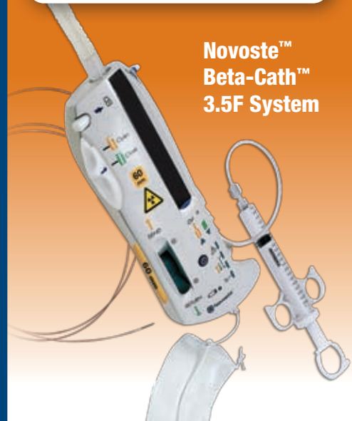
Novoste™ Beta-Cath™ 3.5F System