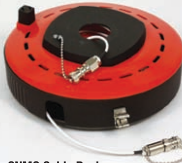
CNMC Cable Reels