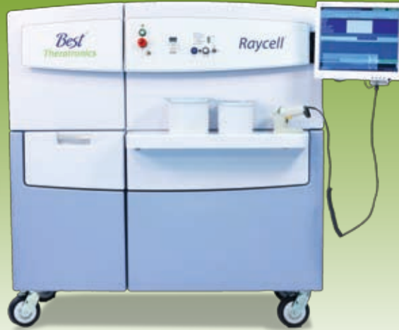
Best™ Raycell Mk2 Blood/Research Irradiator