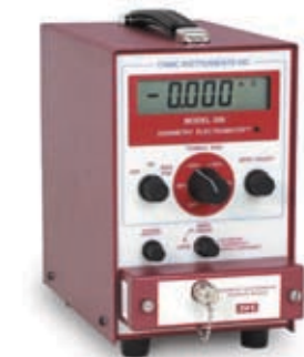
Model 206 Dosimetry Electrometer