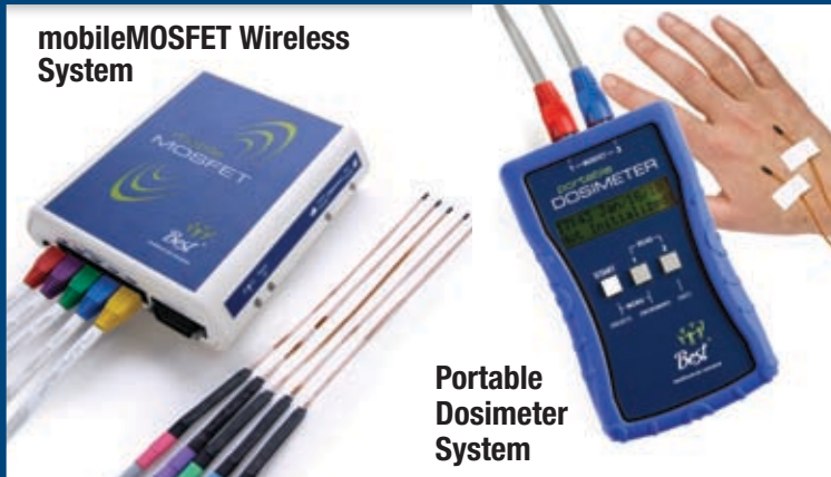
Portable Dosimeter System

Best Medical International, Inc. 7643 Fullerton Road, Springfield, VA 22153 USA tel: 703 451 2378 800 336 4970 www.besttotalsolutions.com www.teambest.com