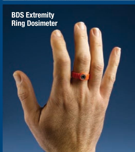
BDS Extremity Ring Dosimeter

A book to be published and distributed free of cost at the 2021 ASTRO Annual Meeting!