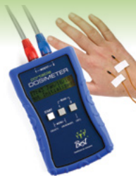
mobileMOSFET Wireless Dosimetry System