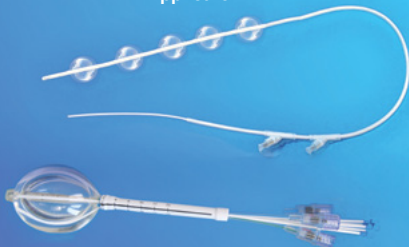
Best™ Breast Double-Balloon Brachytherapy Applicator