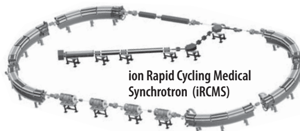
* Best iRCMS is under development and not available for sale currently.