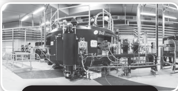
Installation of Best 70 MeV Cyclotron at INFN, Legnaro, Italy