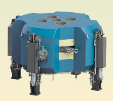
Best Model B35ADP Alpha/Deuteron/Proton Cyclotron