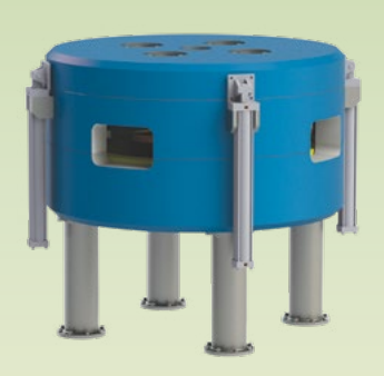
Best Model B25p Cyclotron