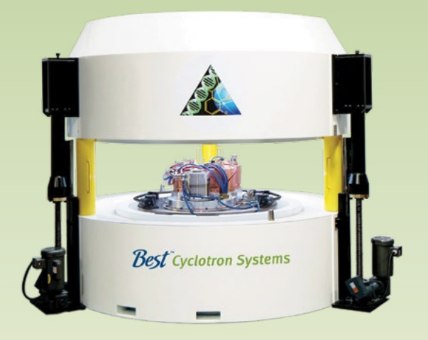
Best B 100p, BG 95p and B 11p Sub-Compact Self-Shielded Cyclotron w/Optional Second Chemistry Module