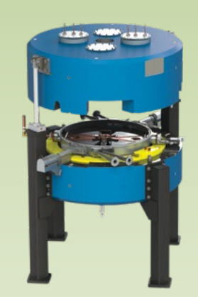
Best Model 6-15 MeV Compact High Current/ Variable Energy Proton Cyclotron