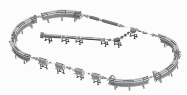
Best Particle Therapy 400 MeV ion Rapid Cycling Medical Synchrotron (iRCMS)