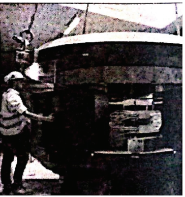
Weight: 170 tons Costed 20 milions of Euros

Legnaro, but at least 700 around the world from South Africa to the United State to those who do research and those involved in medicine. INFN is ready to invest 30 million euro to develop the capacity of SPES, while they expect private sponsors to acquire funds of the same order of magnitude, which will be put toward the nuclear pharmacy able to produce isotopes for medical purposes. SPES is part of a larger European project, Euryalus, which today sees the European nuclear physicist engaged in the construction of three facilities of radioactive ion beams. Besides SPES, in France a machine with similar characteristics is under construction, Spiral 2, and CERN is in the process of upgrading the existing