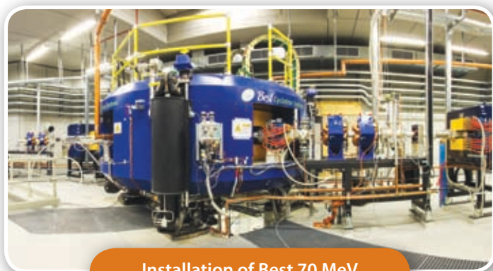
Installation of Best 70 MeV Cyclotron at INFN, Legnaro, Italy