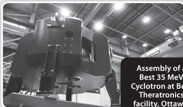
Assembly of a Best 35 MeV Cyclotron at Best Theratronics facility, Ottawa, Ontario, CA