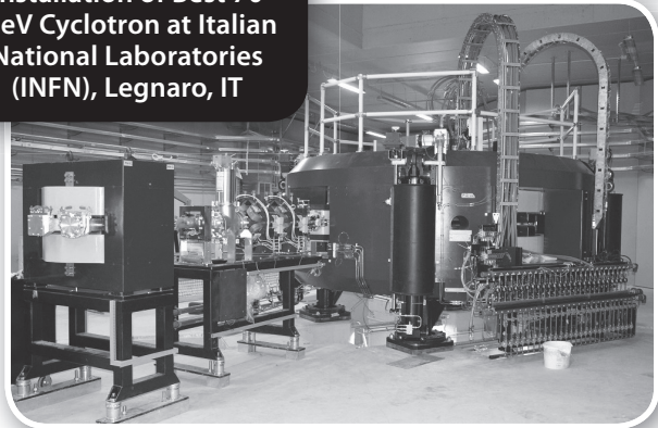
Installation of Best 70 MeV Cyclotron at Italian National Laboratories (INFN), Legnaro, IT