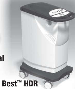
Best™ HDR Remote Afterloader