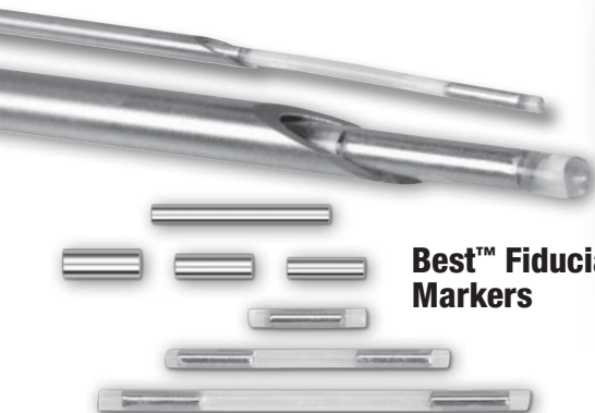
Best™ Fiducial Markers