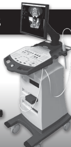
Best™ Sonalis™ Ultrasound Imaging System

Best Medical is the only company that makes custom seeds & strands to your exact specifications — shipped within 24 hours, 7 days a week, sterile & non-sterile!