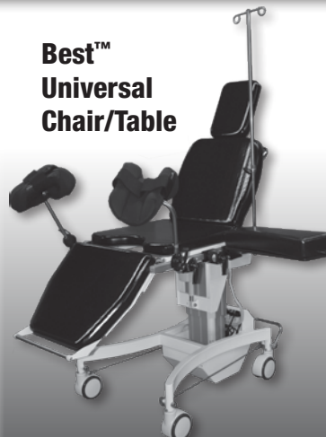
Best™ Universal Chair/Table