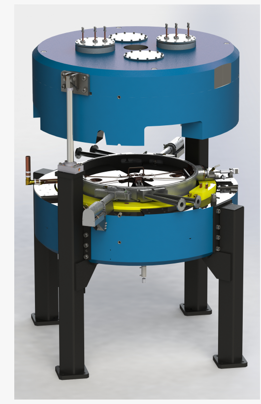
Best 6–15 MeV Compact Variable Energy Cyclotron System (Open View)

"Everyone deserves the Best healthcare. Our goal is to work with medical professionals to provide the Best products and services. Our mission is to uphold our reputation for excellence in the healthcare field by developing, manufacturing and delivering cost-effective, high quality