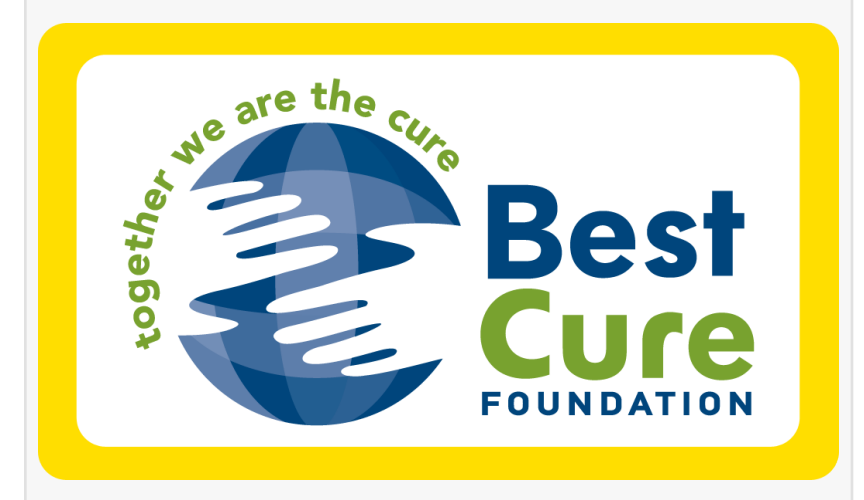
Best Cure Foundation — www.bestcure.md