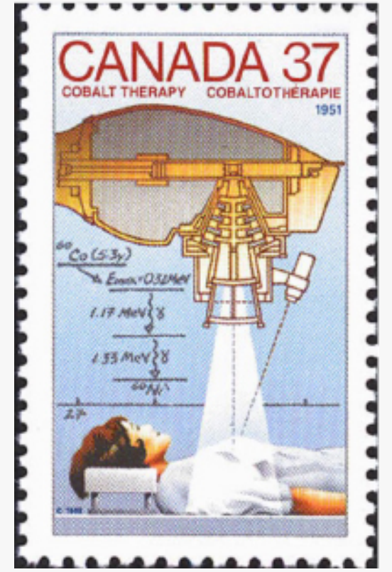
Canada Post stamp from 1951 issued in recognition of Cobalt Therapy.

manufacturing, and delivering reliable medical equipment and supplies for more than 40 years. TeamBest includes over a dozen companies offering complementary products and services for brachytherapy, health physics, medical physics, radiation therapy, blood irradiation, vascular brachytherapy, imaging, medical particle acceleration, cyclotrons, and proton-to-carbon heavy ion therapy systems. TeamBest is the single source for an expansive line of life-saving medical equipment and supplies. Its trusted team is constantly expanding and innovating to provide the most reliable products and technologies.