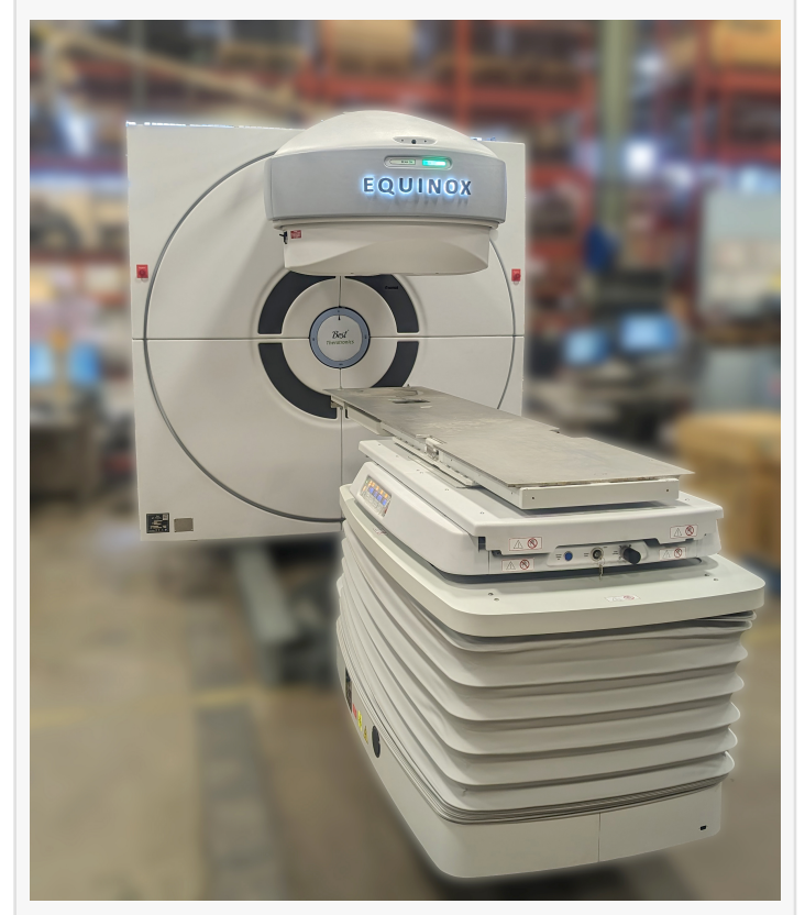
GammaBeam 100-300 CM Equinox in production.

brachytherapy, imaging, medical particle acceleration, cyclotrons, and proton-to-carbon heavy