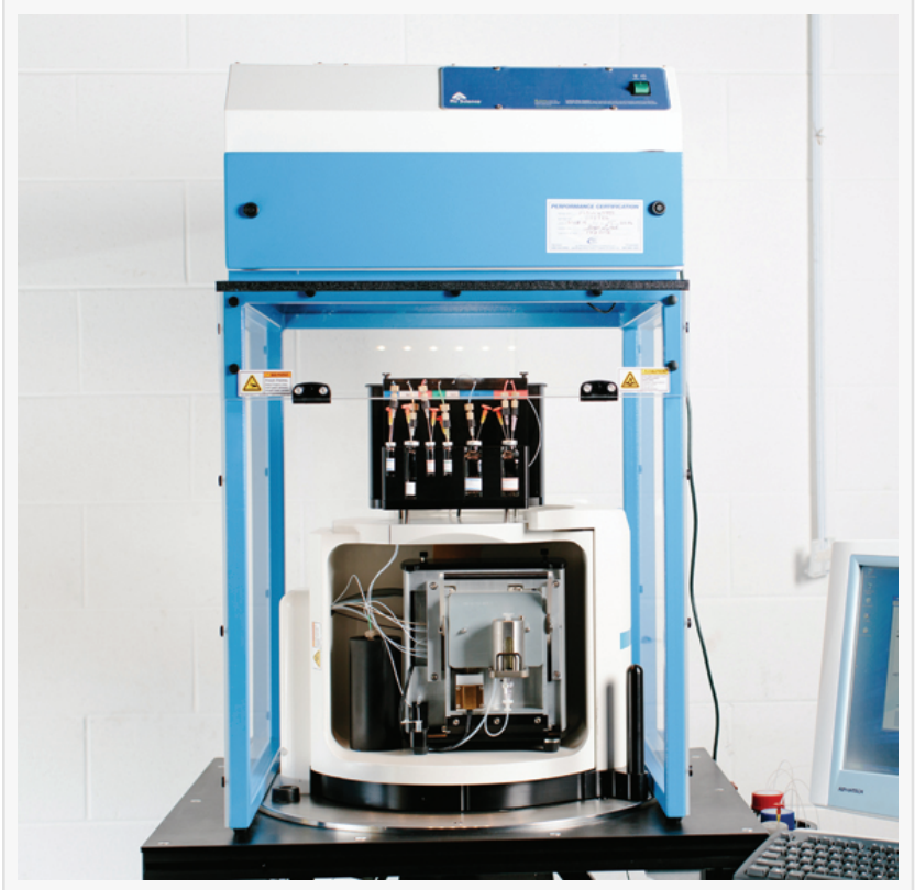
Best Chemistry Module

based in North America producing cyclotrons of varying energies, ranging from 1 MeV to 400 MeV, to hospitals, industry and academic/research centers including for Medical Diagnostic and Therapeutic Applications. TBG's cyclotrons have been installed in thirty sites globally and continue to save lives, by producing radiopharmaceuticals for patients and research.