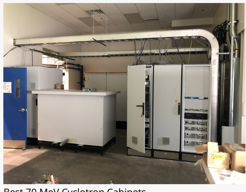
Best 70 MeV Cyclotron Cabinets

BTL had to use 1.35 Million USD of cash to secure this Performance Bond.