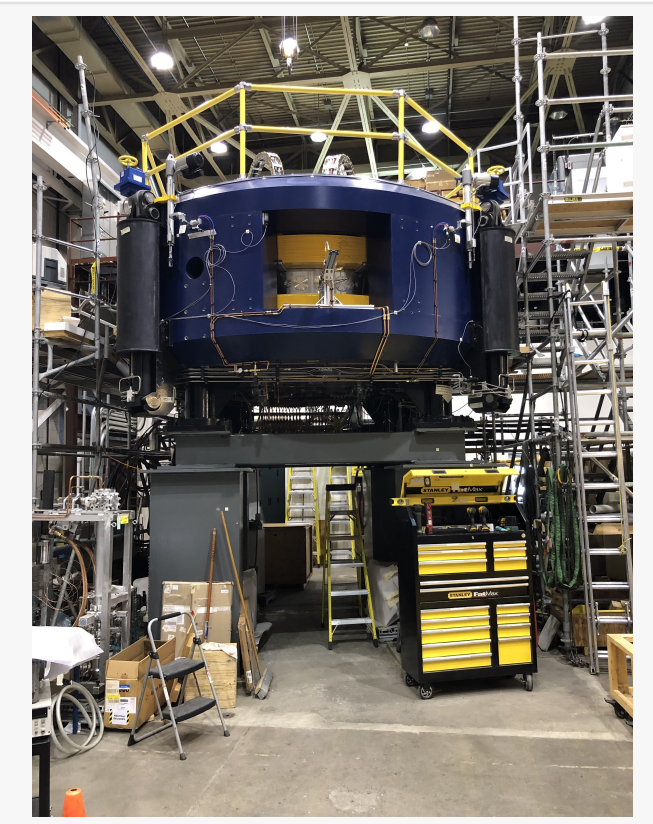
Best 70 MeV Cyclotron Magnet Assembly

This was to be Installed for the IBS — a new project of nearly one billion USD. I have visited IBS at least twice, and my team had visited IBS and PPS multiple times. IBS demanded that BTL post a Performance Bond for 10%. BTL posted a Cash Collateralized Performance Bond of 1.35 Million USD, as Canada's Export Development Corporation (EDC, who had lost 500 million USD by lending to a Colombian, S. American National who may have filed for bankruptcy, but will not support BTL in Ottawa, where the Canadian Government and EDC HQ are located, while BTL is the most sophisticated High-Tech Medical Company in Canada, and has been in existence for 70 years, saving millions of lives annually around the world) has not been supporting and providing the Insurance; therefore,