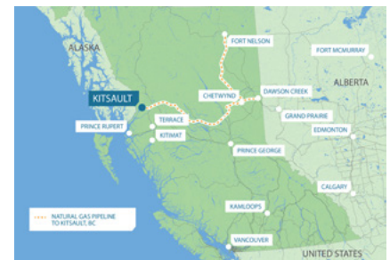
Kitsault Energy Pipeline Route